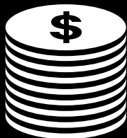
Big 5 banks