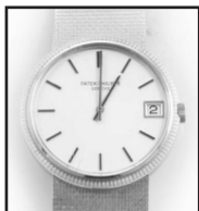
All Gold Patek Philippe

Exceptional Fine Jewelry: Diamonds, Rubies, Emeralds & Sapphires set in Rings, Bracelets, Earrings & Necklaces. Watches: Rolex, Piaget, Patek Philippe, Cartier, Breitling, and others.