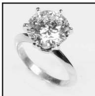
5ct VS2 GIA Cert Diamond Ring in Platinum