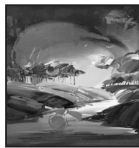
Peter Max Painting