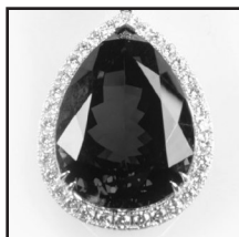
85ct Tanzanite & Diamond Necklace