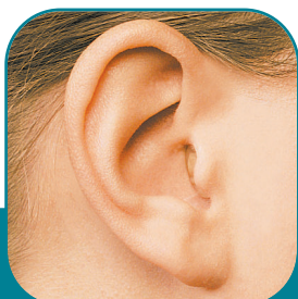
Completely in Canal