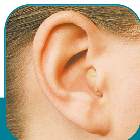
In the Canal