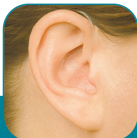
Behind the Ear

*Limit one aid per patient at the promotional price only. Not valid with any other discount or offer. Does not apply to prior purchases. Valid on model Audiotone Pro only. Offer expires 01/20/18. PROMO CODE NP QT 0118.